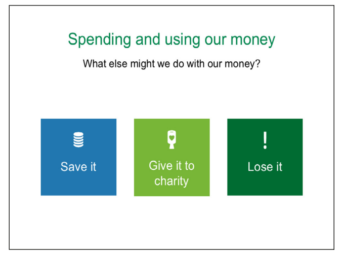
PPT SLIDE 4: Spending and using our money